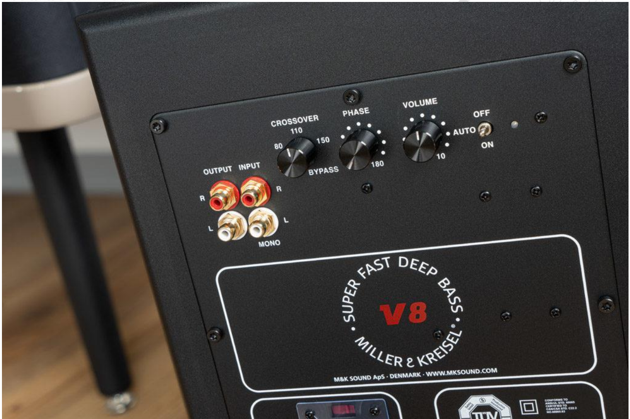
Fine tuning: The V8 offers numerous options for sound shaping.