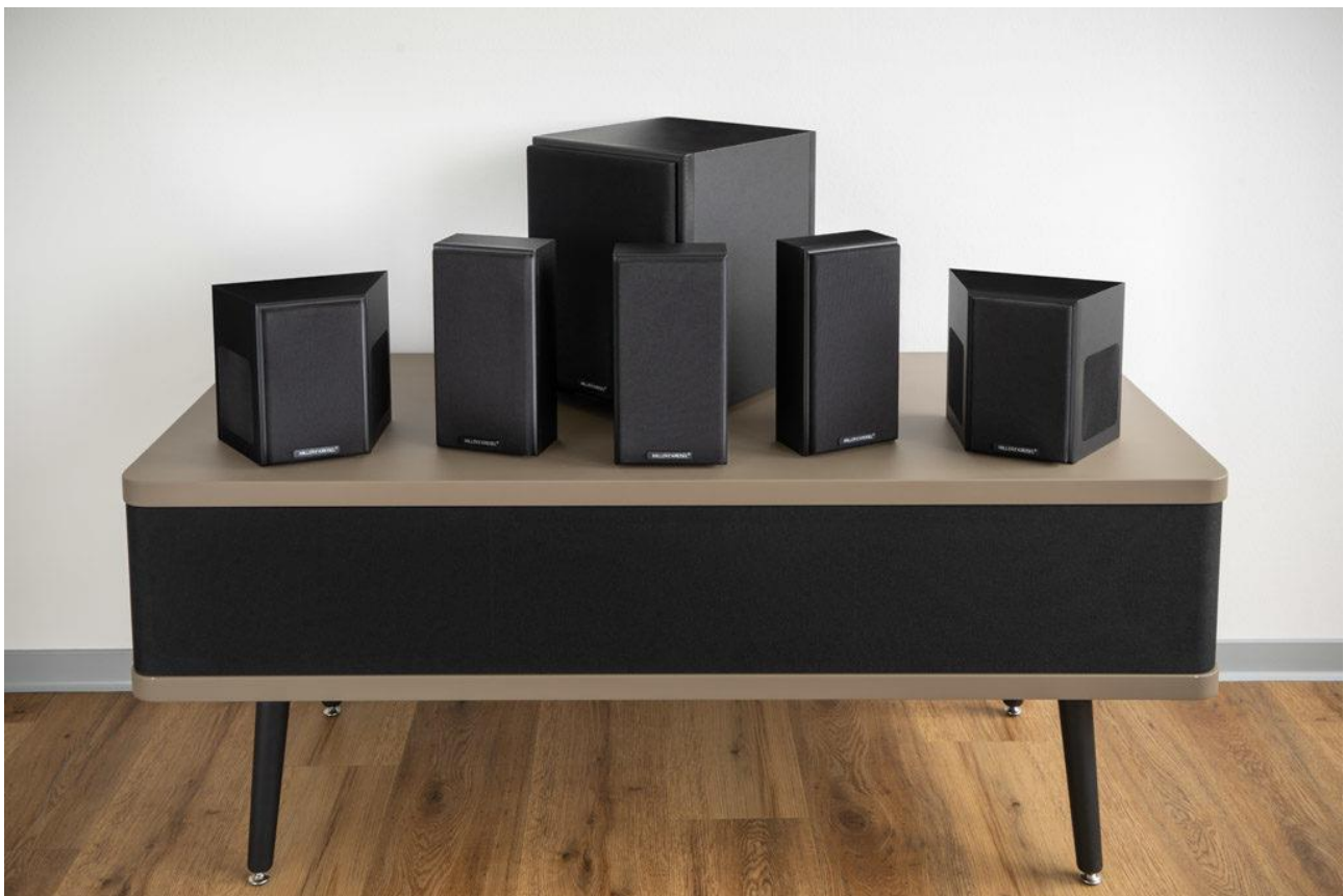
The compact surround set consists of the three LCR speakers K50, the two surround speakers and subwoofer K40T V8.

The quality of the M & K transducers but speaks not only many years of experience. Over time, the setups helped several Hollywood productions, at least indirectly to the Oscar for best sound. These include "The Lord of the Rings", "Wall-E" and "Black Hawk Down". Nevertheless, the name "Miller & Kreisel" especially among home theater novices still an insider tip. An amazing underestimation, which should be finally corrected with the "Movie 5.1 system". Finally, M & K boxes are very familiar with blockbuster sound and can bring him consistently in the four walls.