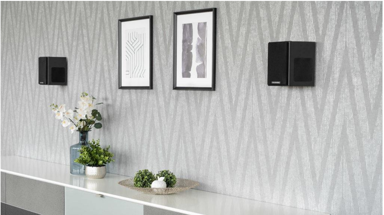
The surround setting of K40T looks very authentic and provides real cinema feeling.

urges the sidelines yet swallowed the scarce dialogues. As before, the Center does a great job here and makes us very well understand why Wick and his opponent just do not like good special. So much can be revealed: In bad weather it is not.