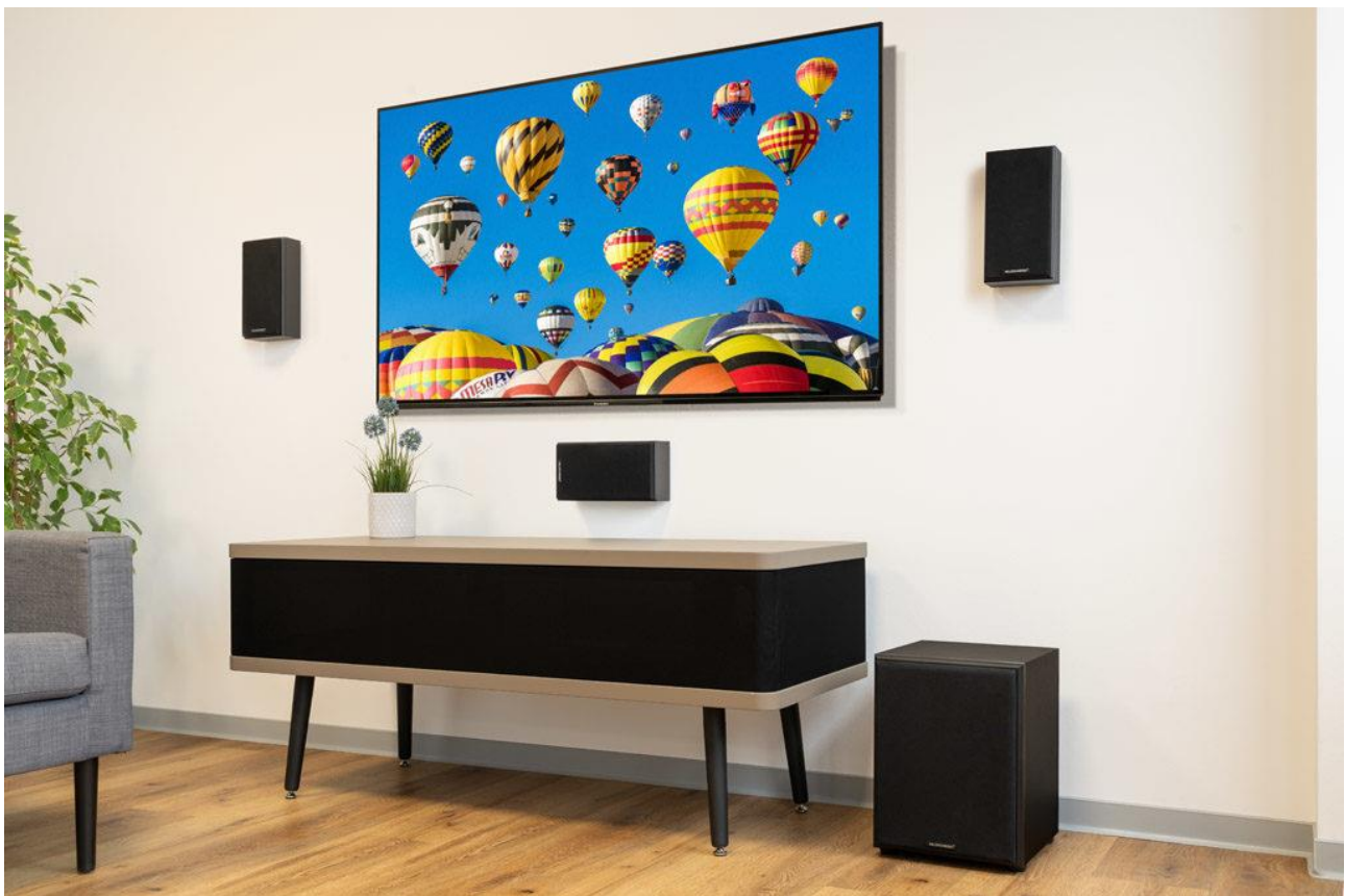
The "Movie 5.1 system" of Miller & Kreisel is ideal for the space-saving wall mounting.

In large cinemas space is large, the domestic private cinema, however, it is sometimes quite closely. If the available floor space very few and far between, back inevitably surround sets the focus, suitable for wall mounting. The 1,500 Euro very attractive "Movie 5.1 system" of Miller & Kreisel certainly saves on space, not on sound.