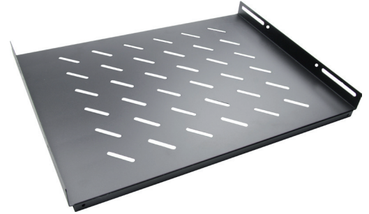
Image of SPR60FS, SPR80FS is the same but only differs in depth.

A 19" Fixed shelf made of steel with a plate thickness of 1,2 mm and provided with a black (RAL9004) structured powder coating. The shelf can be used to store equipment which doesn't contain a standard 19" mounting fixture. For use with SPR racks only.