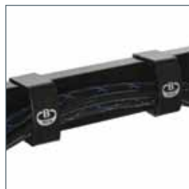
CLIPLOGIC™ cable management