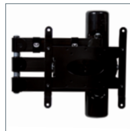
Space saving design - folds flat to the wall