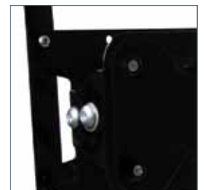
Security locking screws provided